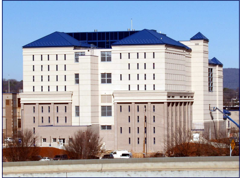
HUNTSVILLE/MADISON COUNTY JAIL

The previous general contractor, engineers, and architect were removed from the troubled Huntsville / Madison County Jail project. After months of sitting idle, the negotiated project was awarded by cost plus contract to Lee Builders, Inc. for remediation and completion.