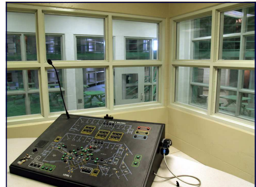
GUARD'S 360 DEGREE VIEW OF CONTAINMENT AREAS

Construction: includes caissons, grade beams, cast and pre-cast concrete, structural steel, reinforced masonry, EIFS, light gauge metal framing, standing seam metal roof, electronic security systems, electrical, HVAC, plumbing, fire alarm, smoke removal system, fire protection, video visitation, and tie-in to existing secure prison facilities.